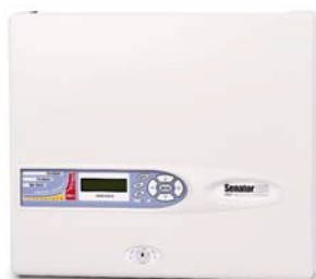
Senator 200 detector