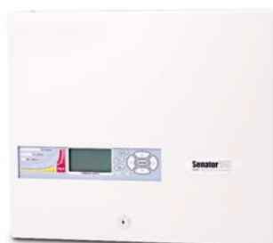
Senator 200 detector with command module - steel enclosure