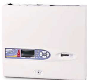
Senator 200 detector with command module