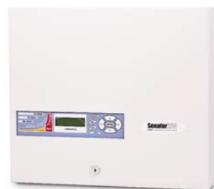
Senator 200 detector - steel enclosure