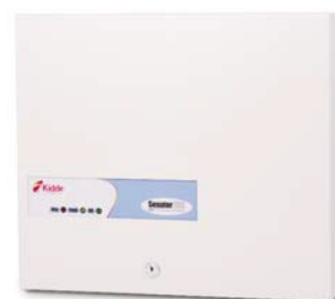
Senator 200 minimum display